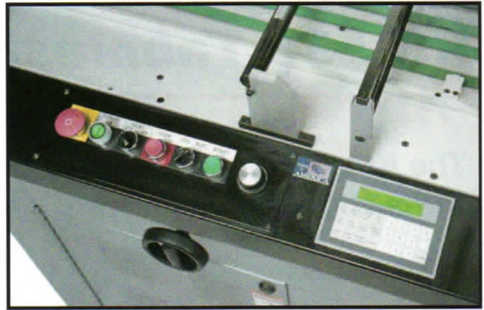
A straightforward operator interface simplifies operator training and setup.