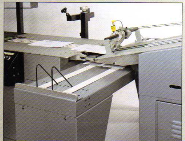
Minimal set-up time is needed because the KR 630 rolls into position over-top the shingle conveyor

Specifications subject to change without notification Guards have been removed for clarity. Do not operate machine without guards in place.