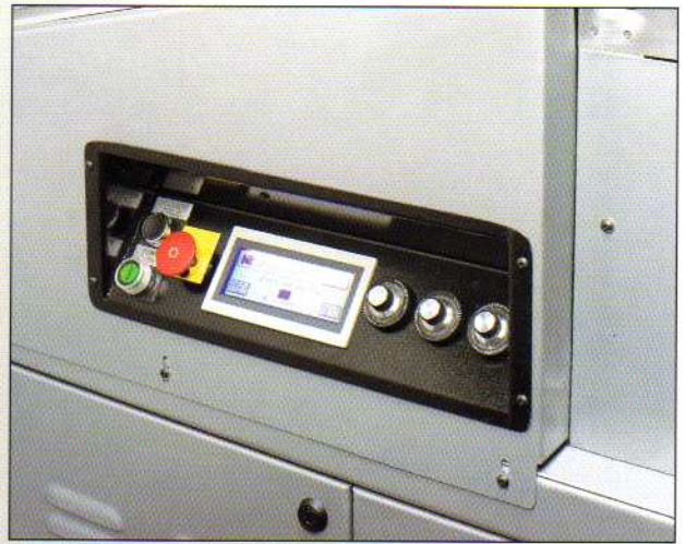
A straightforward operator interface simplifies operator training and setup