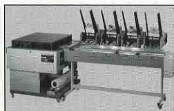
The QuickWrap H-50-4 includes infeed conveyor and four Universal Friction Feeders